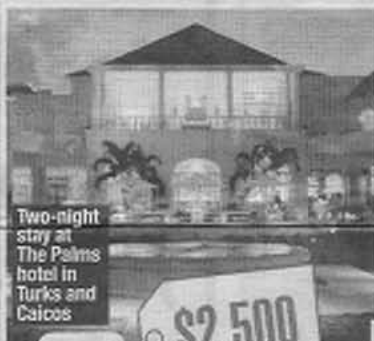
Two-night stay at The Palms hotel in Turks and Caicos

The MTV Video Music Awards gift bag, given to presenters and other VIPs, is stuffed with $26,000 worth of goodies, including: